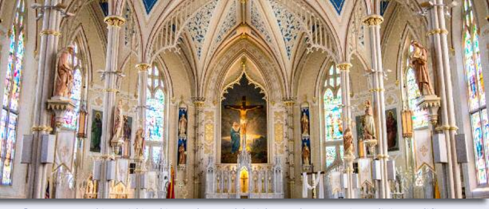
Jesus was teaching within this opulent and lavish temple, a massive religious edifice, but Jesus didn't take time to marvel at the stained glass windows or the remarkable architecture.... Jesus pointed out a defenseless woman who was in religious bondage.

bring honor to their religion. Jesus, however, associated with those who were regarded as embarrassing losers, people whom the religious establishment discounted.